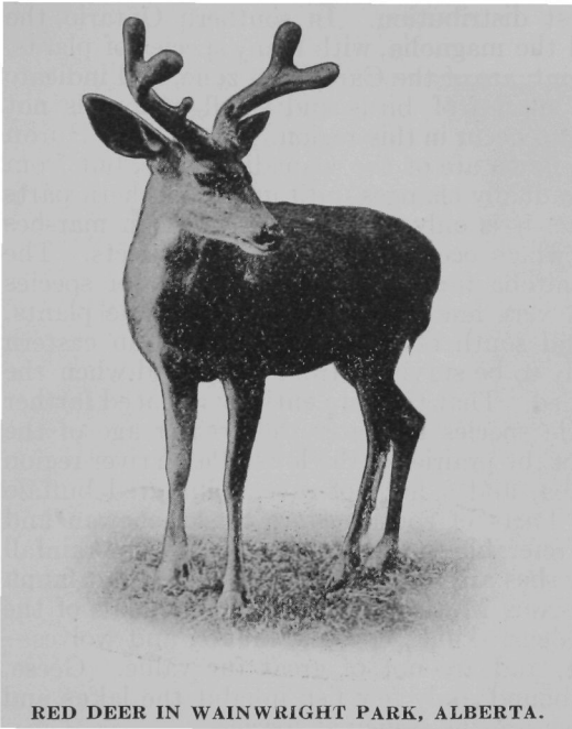
RED DEER IN WAINWRIGHT PARK, ALBERTA.

caribou and one or other of the true deer are now found in, or in recent